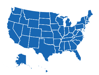
Nearly 62 million Americans are covered by Medicaid

Cancer patients and survivors — our family, friends, neighbors and co-workers — rely on Medicaid.